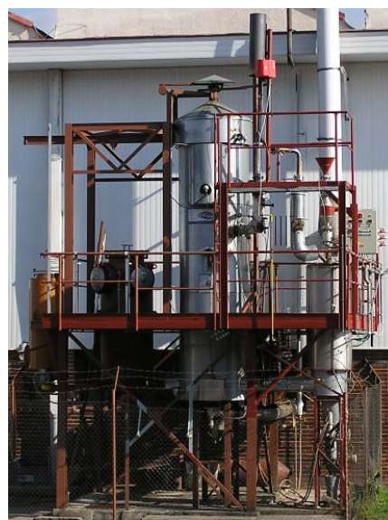
Fig. 1 Experimental equipment Biofluid 100

Research was performed at Biofluid 100 stand (see Fig. 1) which is equipment with stationary fluidized bed.